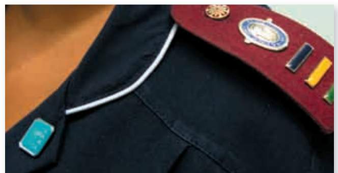
The ComaCARE badge sits proudly on the lapel of a well trained neurosurgery sister