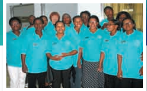
The ComaCARE volunteer team

When my heart opens to patients, my hearing improves