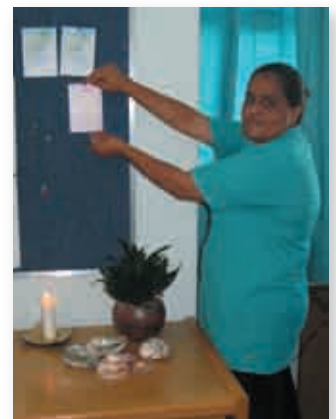
The Memory Card ceremony.

When cure is no longer an option, ComaCARE volunteers accompanying dying patients, some of whom are unidentified and would otherwise die alone. We also acknowledge those who have died with a simple ceremony.