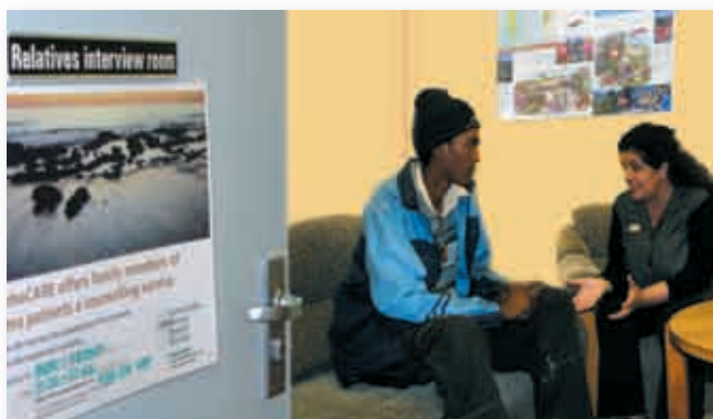
The family counselling room